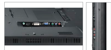
Versatile connectivity: VGA, DVI, HDMI, Composite, Component