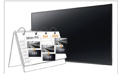
Built-in scheduler automatically activates and deactivates the PM-55 with designated input signal according to programmed schedules