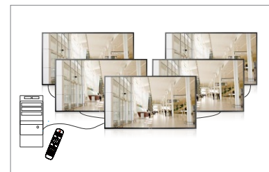
RS-232/ RJ45/IR for remote control